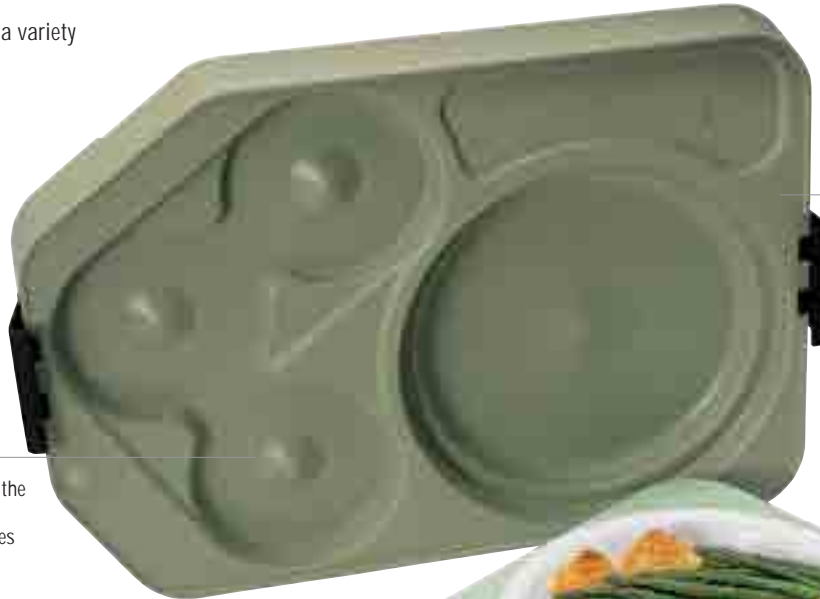
CFC-free foamed-in insulation.