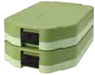
Tablotherms stack for easy transportation and storage.