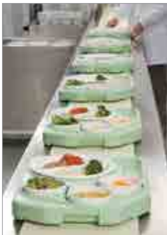
Meal set-up is convenient with Tablotherm trays and dishes.

Safely hold hot and cold meals in one unit.