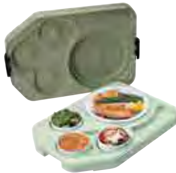
ITPD3753 - Euronorm size