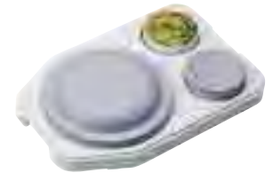
Light gray polypropylene lid with integrated rubber seal. Lids cannot be used in microwave oven.

For a complete guide to maximizing heat retention, contact your Cambro representative.