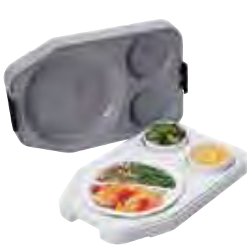
ITPD3253 - Gastronorm size