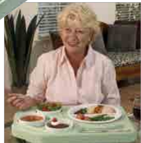
Tablotherms are designed for dining comfort.